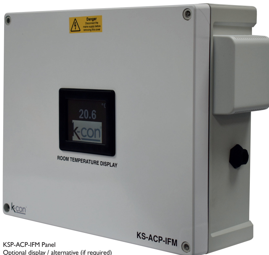
KSP-ACP-IFM Panel Optional display / alternative (if required)

K-con provide an Auto change over, run and fault panel specifically designed for use with Mitsubishi Electric air conditioning units serving computer rooms (N+1 communications room application) where emergency backup and rota is required. The panel runs the indoor units alternately so that the cooling load is evenly distributed over a weekly period.