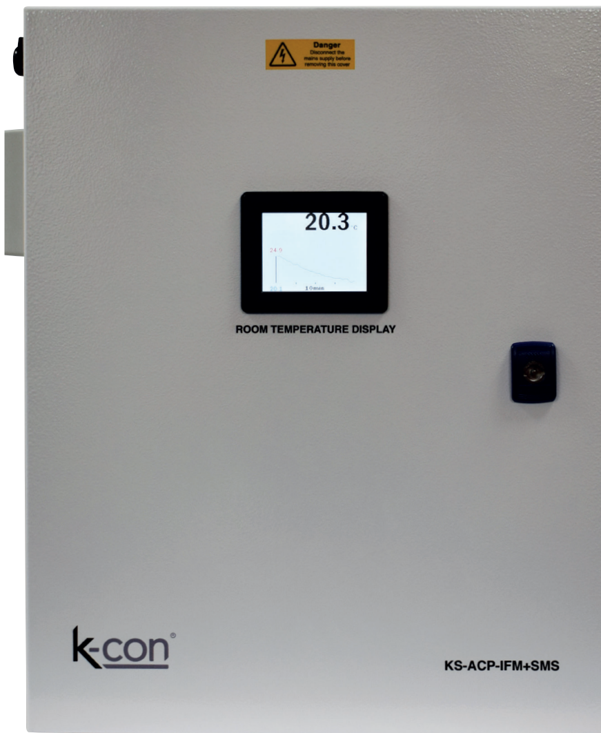
KSP-ACP-IFM+SMS Panel Optional display / alternative (if required)